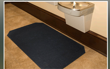
CleanShield® Roll Goods (Adhesive-Back Matting)