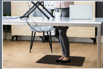
TuffComfort® Standing Desk Mat

Prolonged standing puts pressure on the feet, leg muscles, spine, neck, and shoulders which can lead to chronic pain, injuries, and muscular disorders. By providing employees with anti-fatigue mats in standing areas, or even at their desks, it can increase productivity and reduce the pain associated with standing for long periods of time. Standing on an anti-fatigue mat at your desk burns calories, reduces energy consumption, alleviates stress to the back and legs, and also reduces fatigue as a whole.